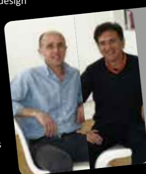
设计师: Gaetano Manganello Camelio Turino 设计单位: 意大利设计中心 项目地址: 西西里拉古萨

The overall design process, from the thoughts and design plan at the initial stage to the construction of a high-quality and valuable building, takes catering for the client's demands of the location and environment as a starting point, which are all reflected in the design process. The designer has tried multi-disciplinary design to attempt to achieve the maximum effect with the minimal forms. The designer has made perfect interpretation of the classic match of black and white and with the strong contrast of surreal colors. The black spiral staircase in the center of the hall spirals up towards the upstairs, arousing people's desire to stepping on it. Extensive cold tone of black and white has made the space brighter and more spacious, which makes it easy for customers passing by to see clearly the shoes and bags in the store and motivates their desire to buy.